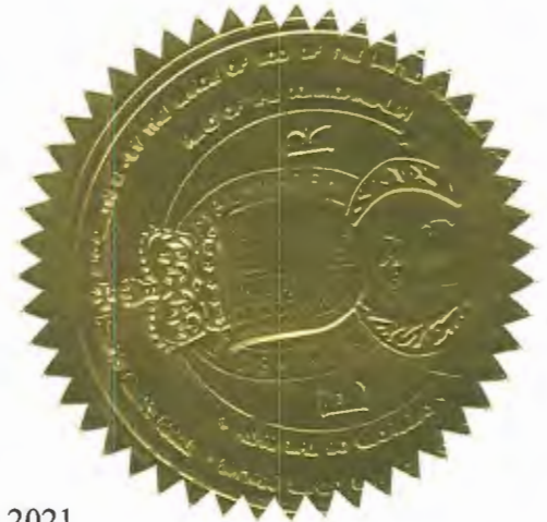
Nigel Dakin Governor